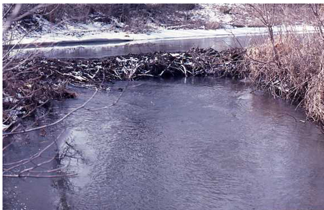
Figure 2. The American Beaver ( Castor canadensis ) is an example of an allogenic engineer - its dam building activities alter the environment.

Allogenic engineers alter the environment through their activities . The American Beaver ( Castor canadensis ) is the traditional example of an allogenic engineer. These industrious mammals use trees and other vegetation to construct dams (Fig. 2). Beaver dams alter streams in several ways; decreasing water flow is the most noteworthy effect. Slow-moving water allows fine soil particles and organic matter (i.e. decaying plants) to settle to the bottom, enriching the water of the beaver pond.