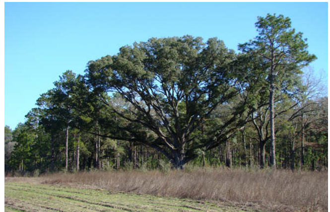
Figure 1. A Live Oak tree ( Quercus virginiana ) is an example of an autogenic engineer - its presence and physical structure provides and modifies habitat.

example, light levels are typically lower and temperatures are cooler under the protective cover of the canopy than in areas beyond the canopy.