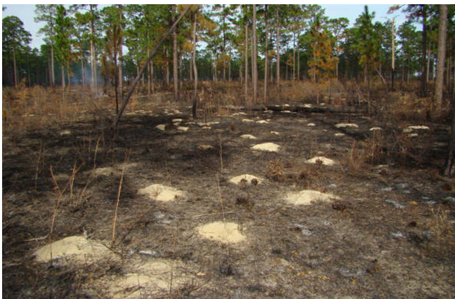
Figure 5. The Southeastern Pocket Gopher ( Geomys pinetus ) tills the soil by digging tunnels and building mounds -- probably its most important habitat-altering activity.