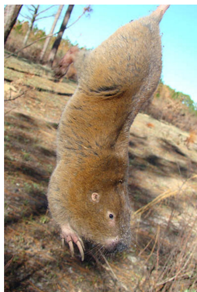
Figure 3. The Southeastern Pocket Gopher ( Geomys pinetus ) is an important allogenic engineer in Florida.

An important allogenic ecological engineer in Florida is the Southeastern Pocket Gopher ( Geomys pinetus , Fig. 3), also known as the "sandy-mounder" or "salamander." This rodent is found in southern Alabama, southern Georgia, and all but southern-most Florida (Fig. 4). Pocket Gophers live in dry, sandy uplands where they excavate extensive underground burrow systems. The most notable engineering activities of Pocket Gophers include soil tilling, tunnel construction (as a source of shelter for wildlife), and root herbivory.