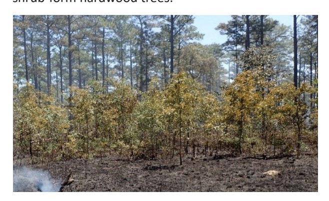
In this gap, these well-established hardwoods (southern red oak and bluejack oak) will not be top-killed by the recent prescribed fire.

Longleaf pine woodlands have some of the highest levels of biodiversity in the temperate world. They are maintained by frequent fires that keep hardwood trees in shrub form by periodically killing their aboveground portions (called "top-kill"), leaving rootstocks to resprout. In the absence of sufficient frequency or intensity of fire, shrub-form hardwoods often grow into the overstory, shading out groundcover plants and making it more difficult to apply prescribed fire. Larger gaps (1/4 acre or more) in longleaf pine canopy caused by lightning, wind (e.g. tornados, hurricanes), and forestry activities can become filled with taller hardwood trees. We hypothesized that a reduction of highly flammable longleaf pine litter in gaps could lead to lower fire intensity and less effective top-kill of shrub-form hardwoods. We monitored the number and height of shrub-form hardwood tree stems for seven years after experimental harvest that created a range of pine tree density conditions to understand how stand density affects top-kill of shrub-form hardwood trees.